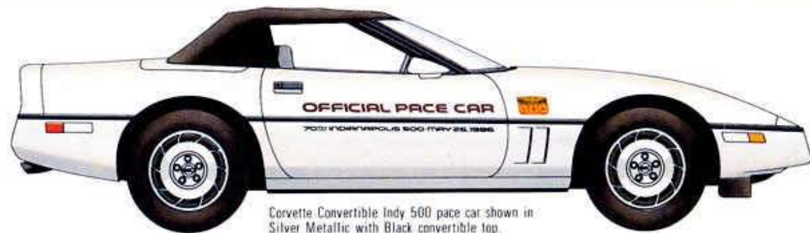
Corvette Convertible Indy 500 pace car shown in Silver Metallic with Black convertible top.