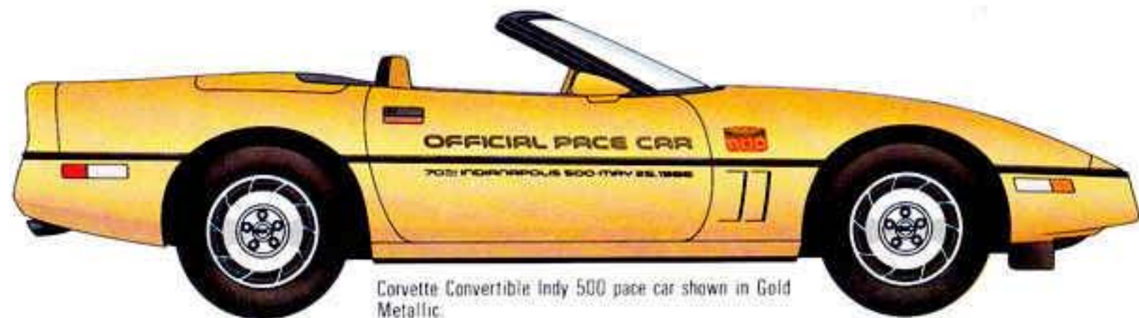
Corvette Convertible Indy 500 pace car shown in Gold Metallic.