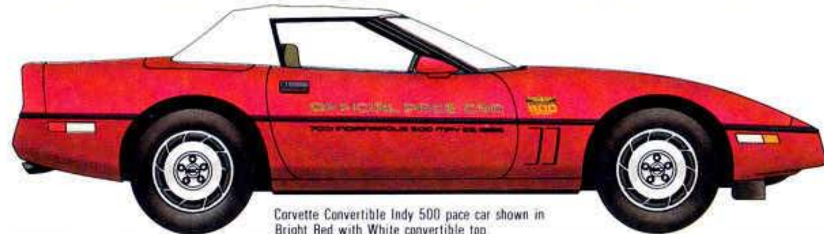
Corvette Convertible Indy 500 pace car shown in Bright Red with White convertible top.