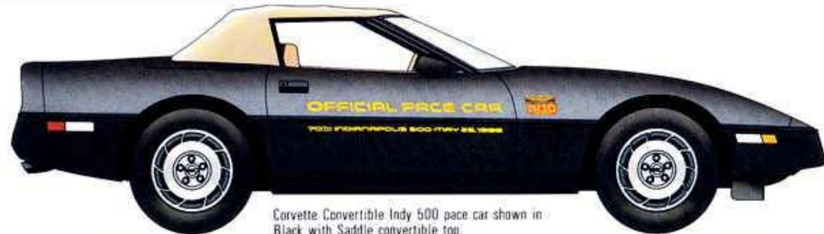
Corvette Convertible Indy 500 pace car shown in Black with Saddle convertible top.