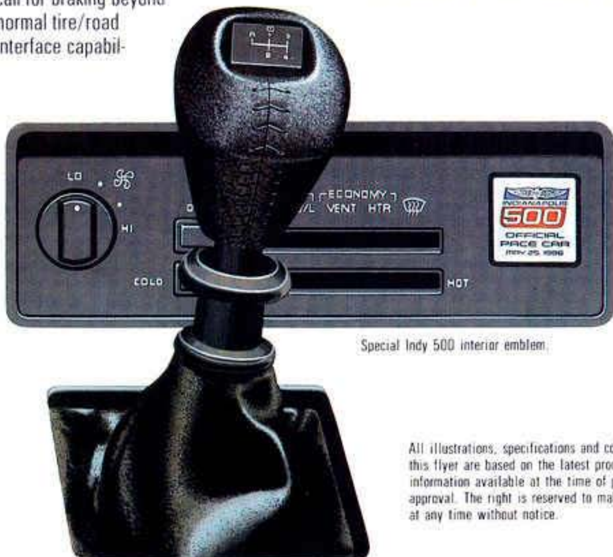
Special Indy 500 interior emblem.

All illustrations, specifications and colors in this flyer are based on the latest product information available at the time of publication approval. The right is reserved to make changes at any time without notice.